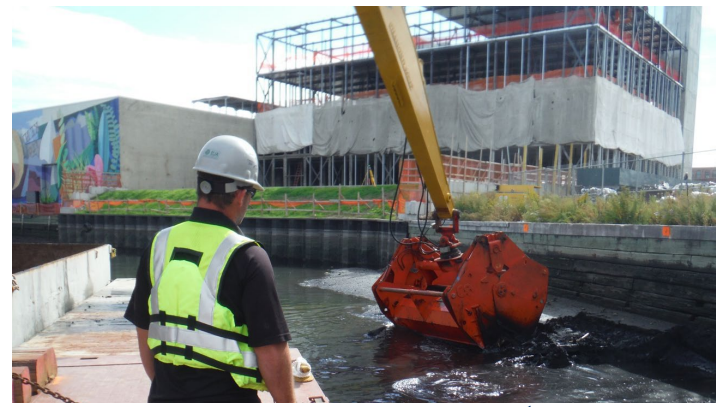
Excavator removing sediment from Gowanus Canal 4th Street turning basin in 2018